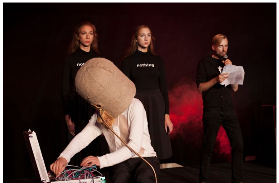
TAB 2017