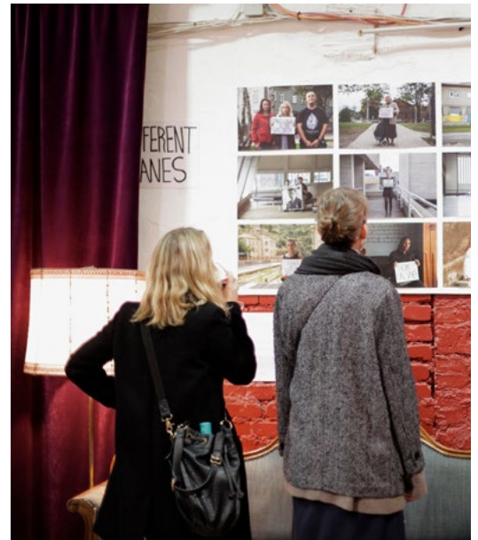
TAB 2017