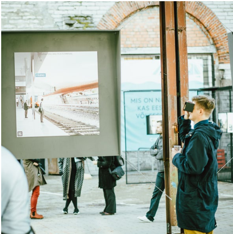
TAB 2017